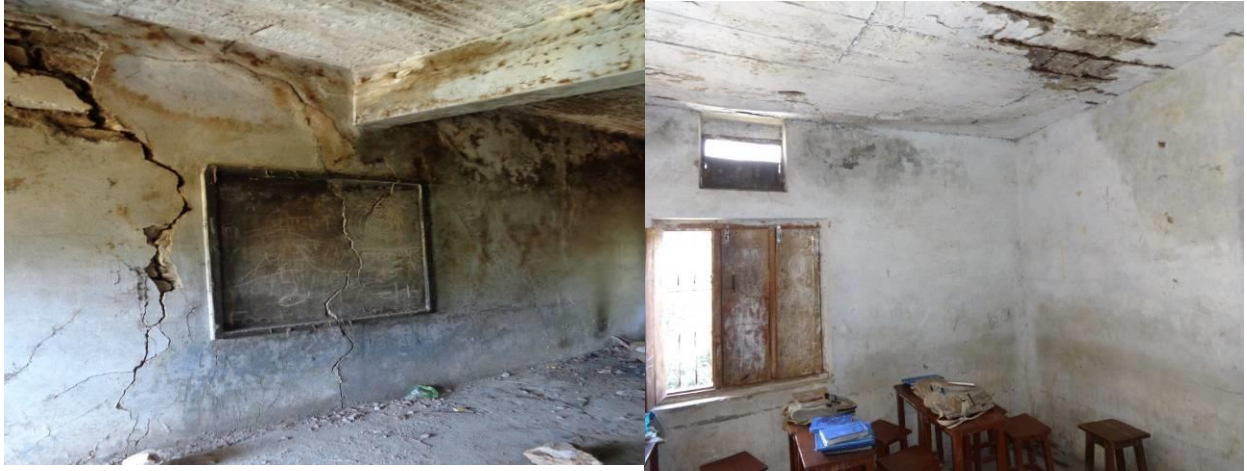
Figure 1 Status of GIC buildings after the flash flood