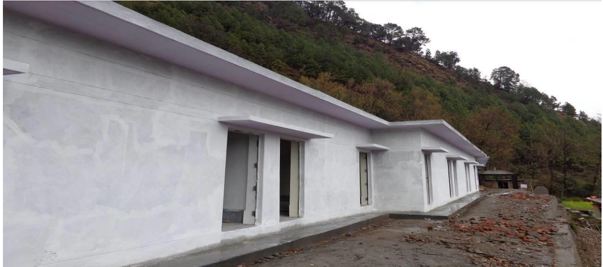
Figure 2 progress of GIC Narayankoti building

As of March 2014, work in GIC Narayankoti is nearing completion while work in GIC Paldwadi is 70 percent completed. It is expected that the work would be completed by April-May 2016 provided weather conditions remain favourable.