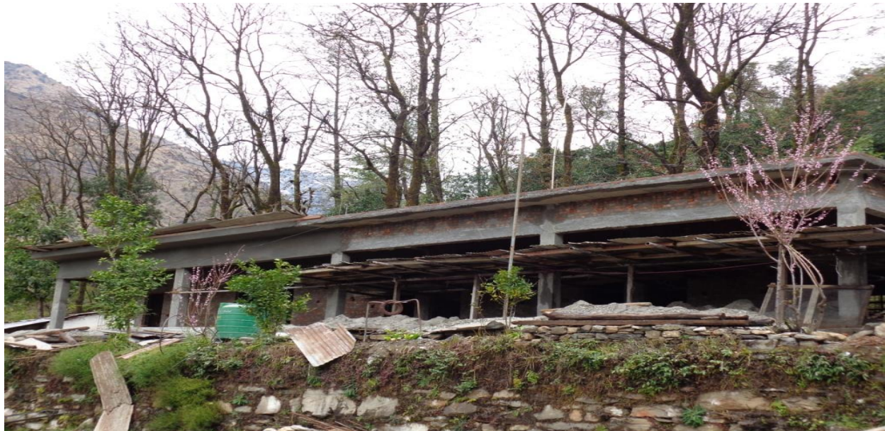
Figure 3 Progress of GIC Paldwari building

Discussions are underway with Empathy Foundation on how to sustain the work and take it forward from here. Educational support and skill building besides support in further developing GIC infrastructure is being explored.